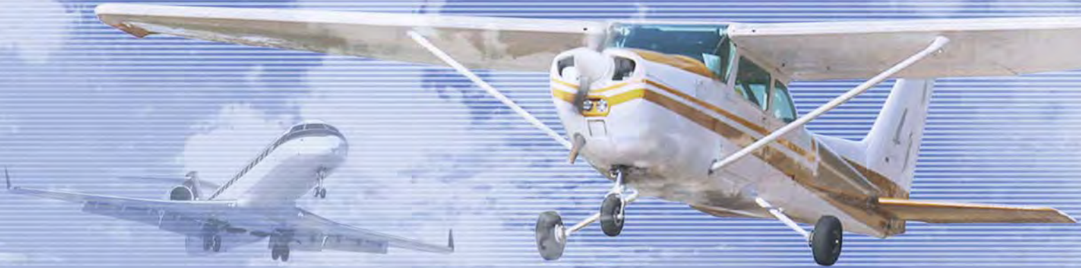
NEW JERUSALEM AIRPORT